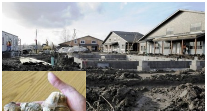
Photo above: A mastodon jaw parts and detached skull was unearthed by heavy equipment operator, Vernon Kessi while digging a sewer line for a new Corvallis apartment complex in December 2011.